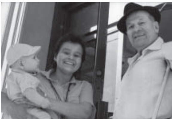
Customers at the Four Corners bank at Hastings and Main.

Source: Percentages are based on the number of storefronts vacant, identified on the inventory maps, relative to a fixed total number of storefronts for all years (n=127).