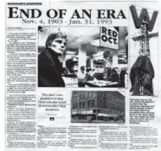
The closure of Woolworth's, Fields, Fedco and especially Woodward's, had a devastating effect on other local services.

The vacancy rate in the area had swelled to 36% by 1996. The demolition of condemned buildings resulted in vacant lots on 100 block East and the 000 block West Hastings for the first time in decades.