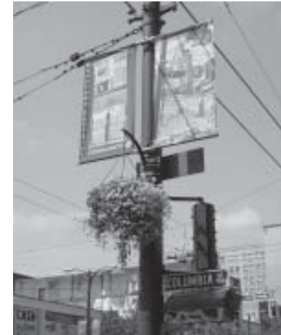
Local initiatives: Street banners and hanging baskets on Hastings street.

The real question driving the debate about the decline and recovery of Hastings Street is this: Who will benefit when the area is redeveloped? The current retail environment of Hastings Street will not remain the same for long. Already new developments, like International Village, are betting on the eventual redevelopment of the DTES. Will new retail and service ventures cater to the consumer and employment needs of the local population? Or will the long-term community of the Hastings Street area be displaced due to an economic development strategy, which, targets tourists and new residents with greater purchasing power?