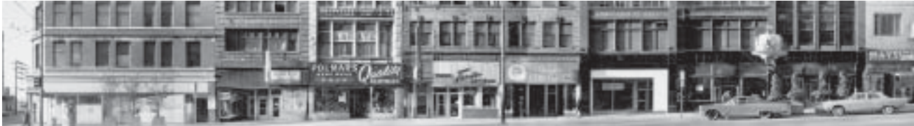
100 block West Hastings South Side in 1974

The challenge will be to restore the area's regional appeal, and to promote retail uses that meet the needs of existing low- and moderate-income shoppers from the neighbourhood and elsewhere in the Lower Mainland. This is our competitive advantage.