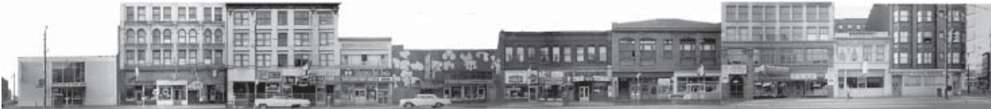
000 block East Hastings South Side in 1974

First, low income, while undeniable and often extreme 14 , cannot be held up as the sole cause of the retail decline. This level of income has been relatively constant. The incidence of low-income has remained high over the past 30 years and even longer (see table 2). So, Downtown Eastside residents were “low-income” even when Hastings was a viable marketplace; to use low income as a scapegoat misses this key point.