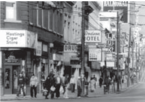
In the mid-1980s, many retail outlets began to close under pressure from suburban mall. (Inset: 1970s drawing by Christina Poire)

However, despite this vibrant retail streetscape and a low storefront vacancy rate of 3.9 %, there were signs of stress, including slum housing conditions, government neglect, and shady businesses. 4 As a result, Hastings Street became known as Vancouver’s ‘skid row.’ Local community groups contested this label because it stigmatized the neighbourhood and offered no community-friendly directions. 5 At this time, the neighbourhood also became the subject of revitalization schemes, including a proposal of covered sidewalks and a transit mall like Granville Street. 6