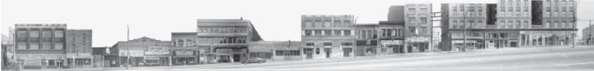
100 block East Hastings North Side in 1974

These closures pushed the storefront vacancy rate to 13%. With the onset of more and more storefront vacancies, Hastings Street showed visible signs of distress and isolation from the rest of the downtown peninsula, which was undergoing an investment boom following Expo 86.