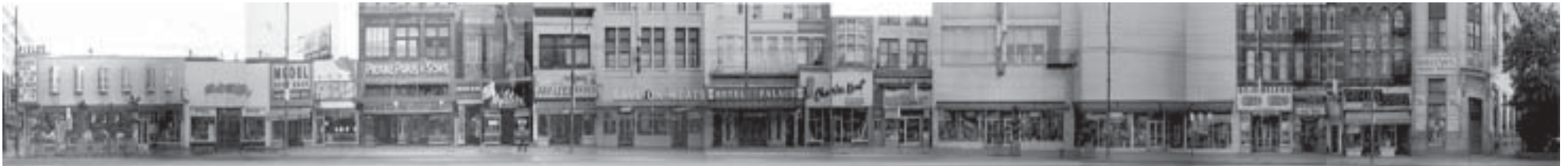
000 block West Hastings North Side in 1974

With these findings in mind, we conclude that the challenge facing the Downtown Eastside community and the City of Vancouver is three-fold: