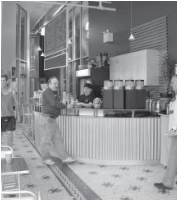
Inside the Sunrise Cafe and laundromat at Hastings and Columbia. One of the recent community economic development projects that provides employment for local residents.

The Sunrise is also the new home of Co-op Radio 102.7 FM.